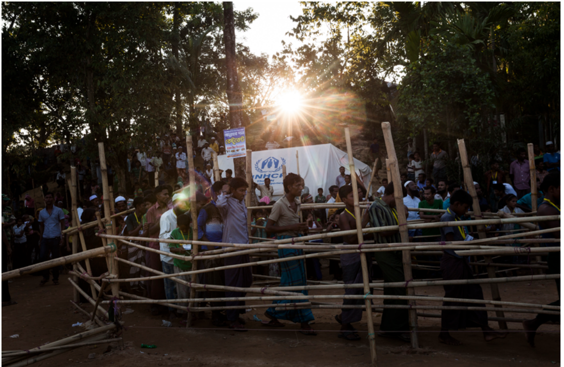
Rohingya refugees line up at a aid distribution center in Balukhali camp in Cox's Bazar District, Bangladesh.