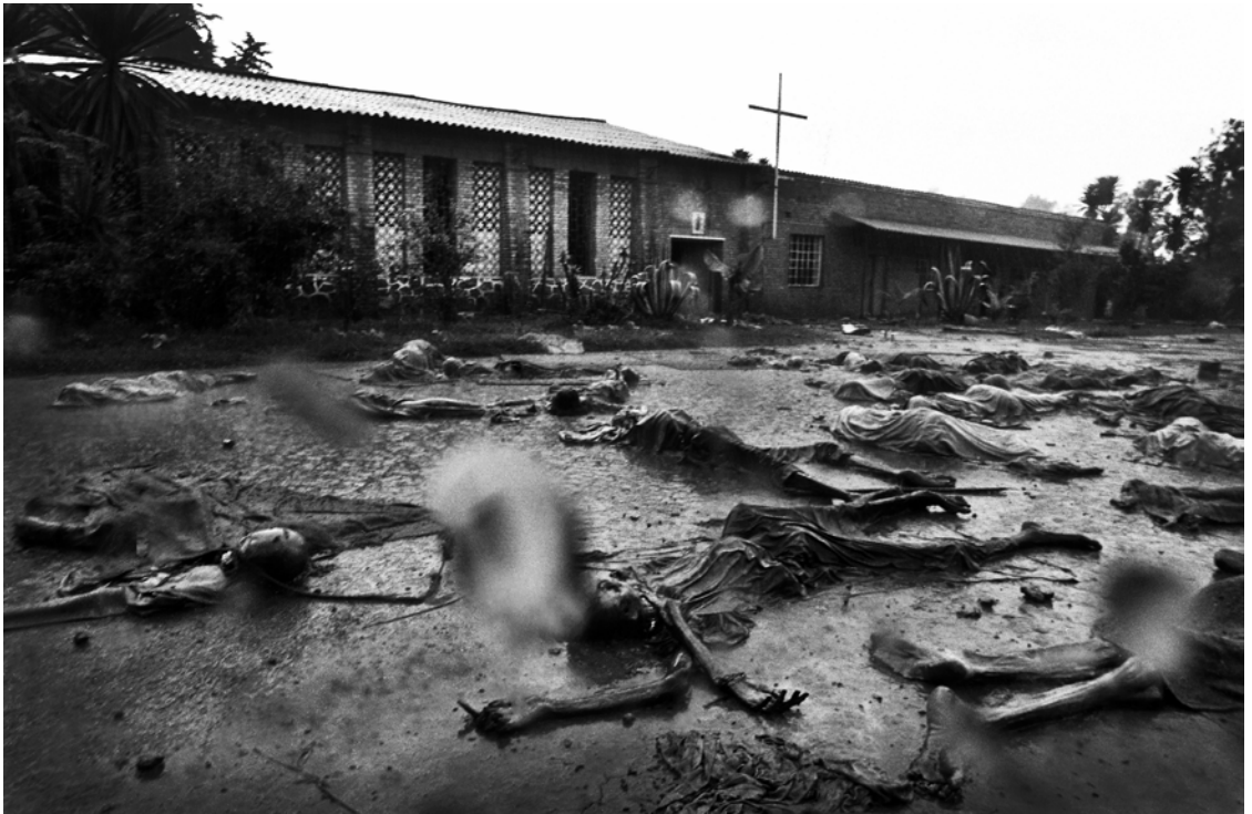
Decomposed bodies of Tutsi massacre victims left outside a Catholic church in Rukara, Rwanda in 1994.