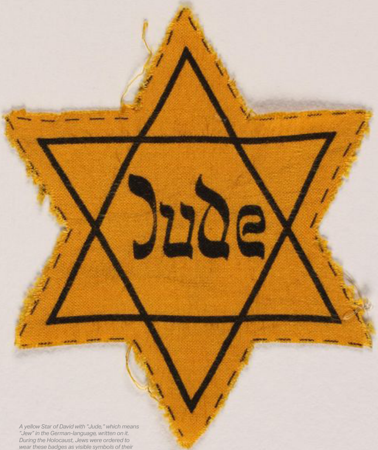
A yellow Star of David with "Jude," which means "Jew" in the German-language, written on it. During the Holocaust, Jews were ordered to wear these badges as visible symbols of their Jewish identity. circa 1941-1945