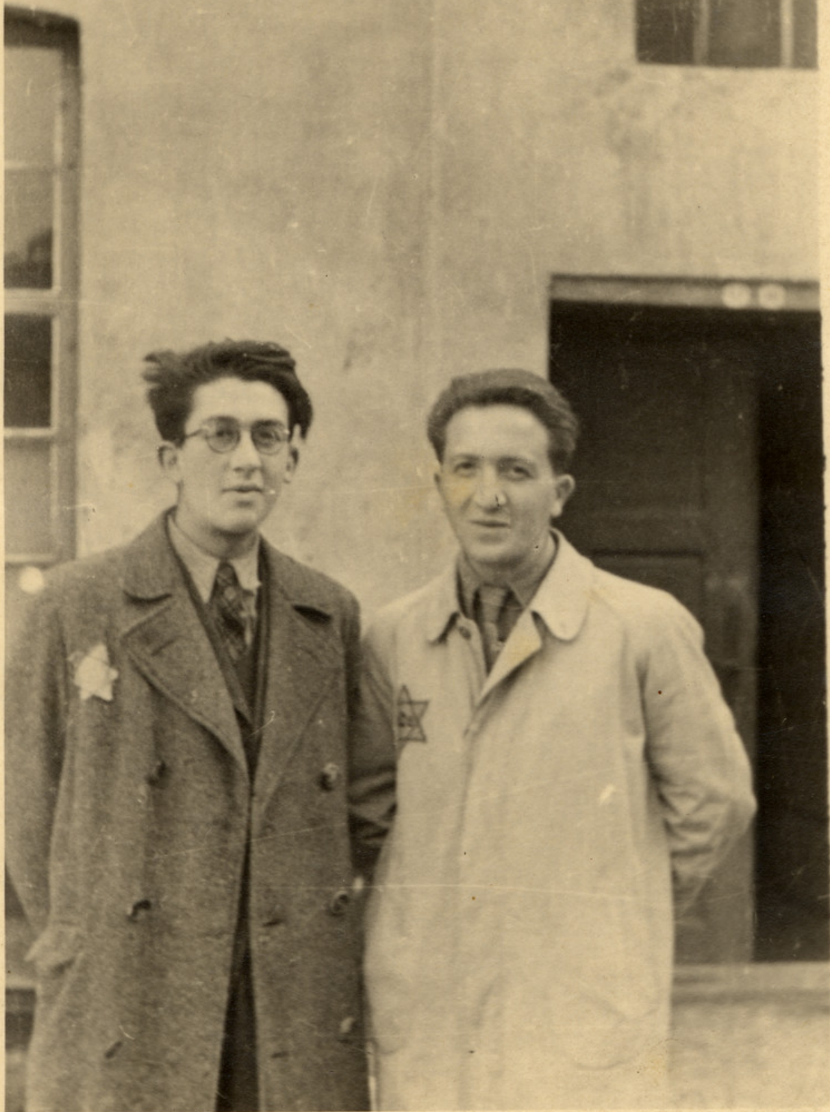
Two men with the Star of David sewn on their jackets in the Łódź ghetto in Poland. During the Holocaust, Jews were ordered to wear these badges as visible symbols of their Jewish identity.