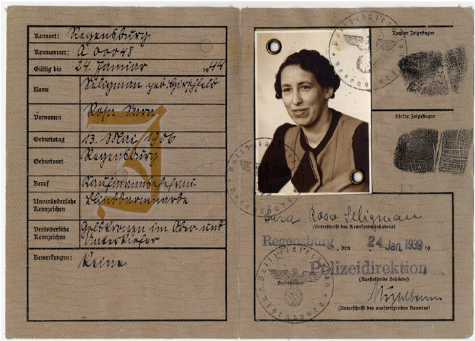
A Nazi-issued Kennkarte identity card stamped with the letter "J" to identify the card-holder as Jewish. The Nazi regime used the Kennkarte as a tool for military, racial, and security controls that made the genocide bureaucratically possible. ©United States Holocaust Memorial Museum, courtesy of Ellen Zweig, January 24, 1939